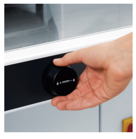
ELECTRONIC HAND WHEEL The electronic hand wheel, with infinitely variable speed control, is used for manual back gauge positioning.