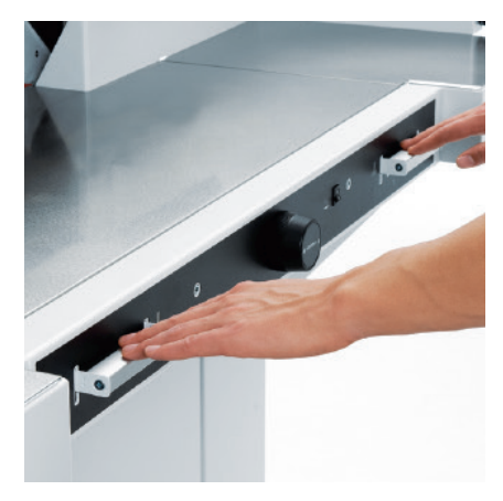
EASY CUT BLADE ACTIVATION BARS Patented EASY CUT blade activation bars ensure true, two-hand operation and allow blade and clamp to be activated independently.