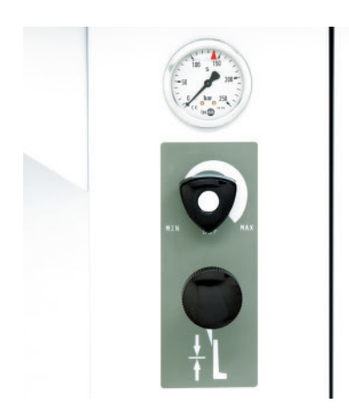
ADJUSTABLE HYDRAULIC CLAMP Clamping pressure is fully adjustable between 1,900 and 3,800 psi.