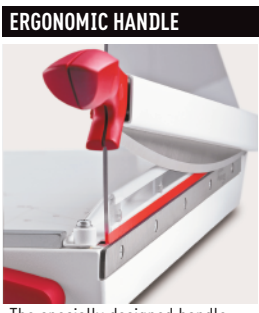
The specially designed handle was developed with comfort and safety in mind.

MyBinding.com 5500 NE Moore Court Hillsboro, OR 97124 Toll Free: 1-800-944-4573 Local: 503-640-5920 All technical data is approximate and subject to change. © MBM Corporation, 5/2010.