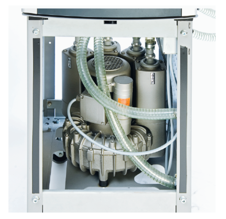
ENCLOSED TURBINE BLOWER

The low-maintenance blower does not require filter changes.