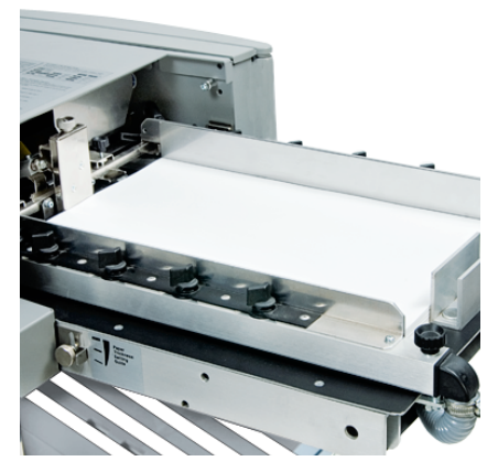
TOP-LOADING PAPER FEED

The low-maintenance blower does not require filter changes.