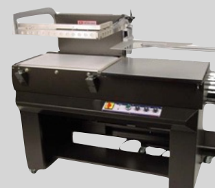
PP-1622MKA-V-PI Air Operated with Vertical Seal Head, Power Film Unwind and Adjustable Film Inverting Head. Great for feeding product inline.