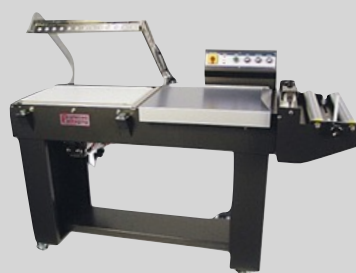
PP-1622MK-A Air Operated Seal Head.