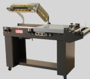
PP-1622HK Hot Knife Seal System Used with Polyethylene Films.