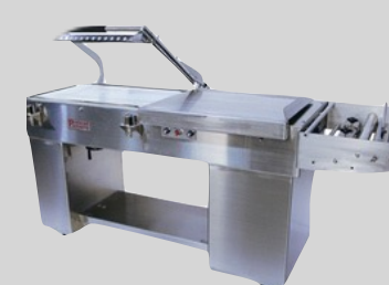
PP-1622MK-SS Stainless Steel Frame Construction.