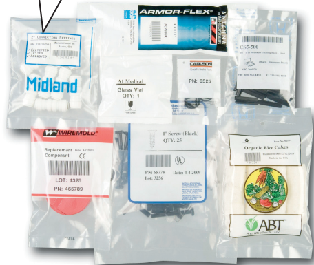
Actual Bag Samples