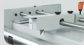
Retractable cutting blades