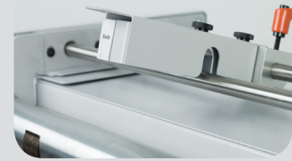
Retractable cutting blades