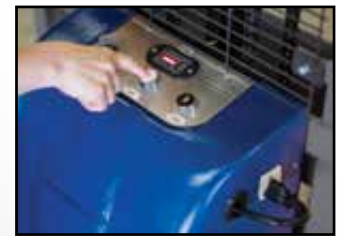
With the push of a button the Power Jumbo easily lifts and lowers.

With a powerful 12-volt DC motor, the On-a-Roll Lifter® Power Jumbo allows one operator to easily lift and lower rolls as heavy as 990 lbs (450 kg), as wide as 16 feet 5 inches (500 cm), and with diameters as great as 19.6 inches. This motorized lifter securely positions large and heavy rolls while providing a safe, effortless, and efficient solution for handling.