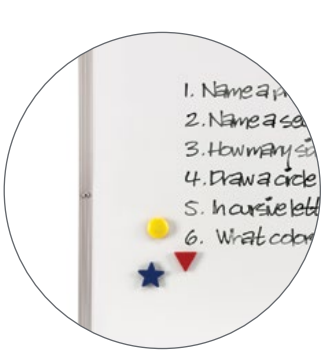
Scratch and Stain Resistant Surface that Accepts Magnets