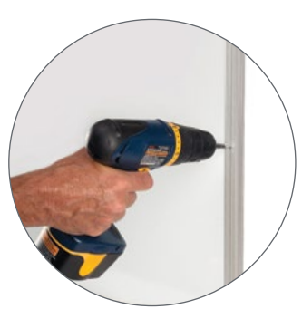
Factory-Drilled Holes for Quick Mounting