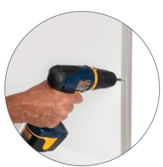
Factory-Drilled Holes for Quick Mounting