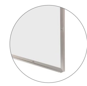
Anodized Aluminum Satin Frame - No Marker Tray