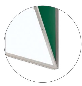
Fits over Existing Framed Boards for Quick and Easy Installations