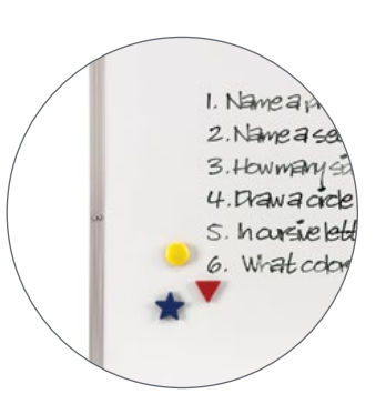
Scratch and Stain Resistant Surface that Accepts Magnets