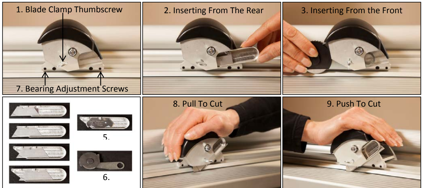
4. Blade Positions

MyBinding.com 5500 NE Moore Court Hillsboro, OR 97124 Toll Free: 1-800-944-4573 Local: 503-640-5920