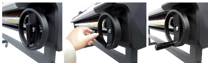
Front Facing Nip Adjustment