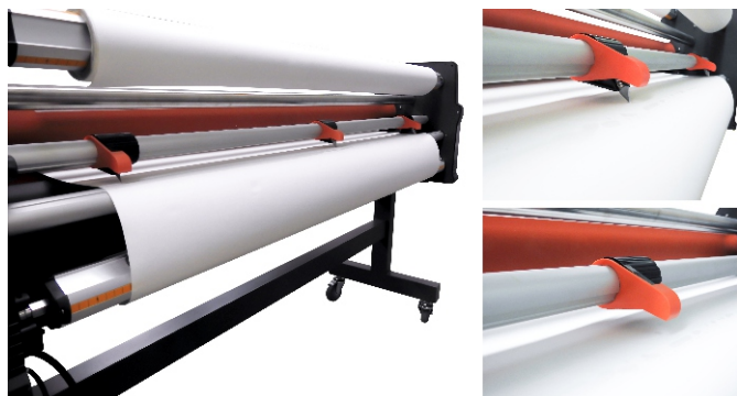
Three Rear Slitters