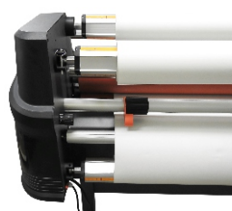
Slitter Micro-Adjustment Knob