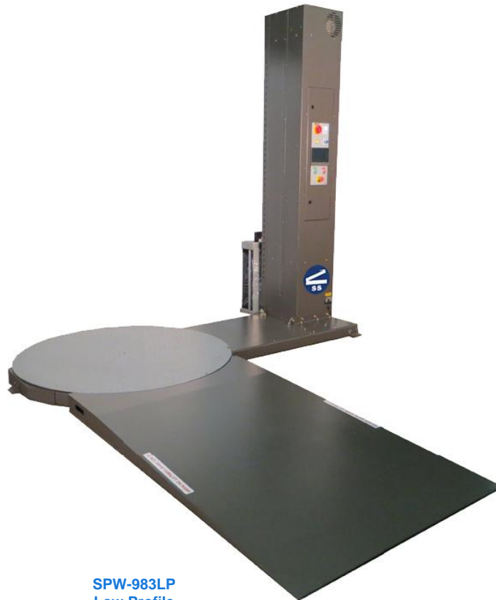
SPW-983LP Low Profile

Patented triple knurled roller pre-stretch system with 225% powered pre-stretch. Easy thread design with safety door; if opened, machine will shut off