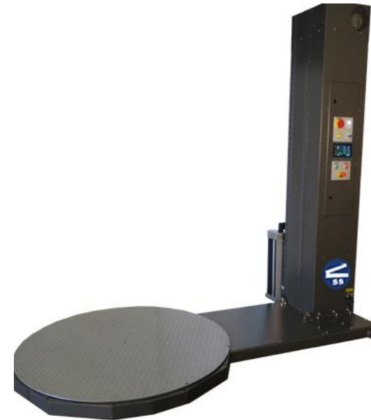
SPW-983HP High Profile Does not include ramp