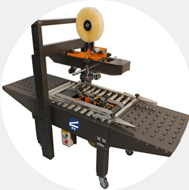
*Shown with optional infeed and discharge roller conveyors and casters

Excellent for wider, taller, heavier boxes