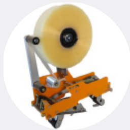
New Tape Head Features an Easy Thread Design with Optimizer Arm