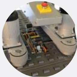
Heavy Duty Side Drive Belts for Positive Grip Pressure