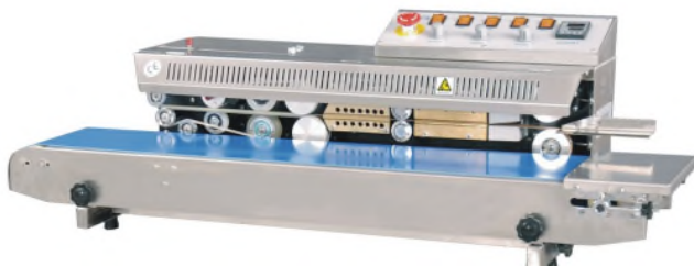
FRM-1010I - HORIZONTAL