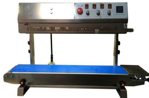
FRM-1010II - VERTICAL