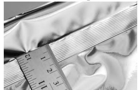
Serrated Seal Example