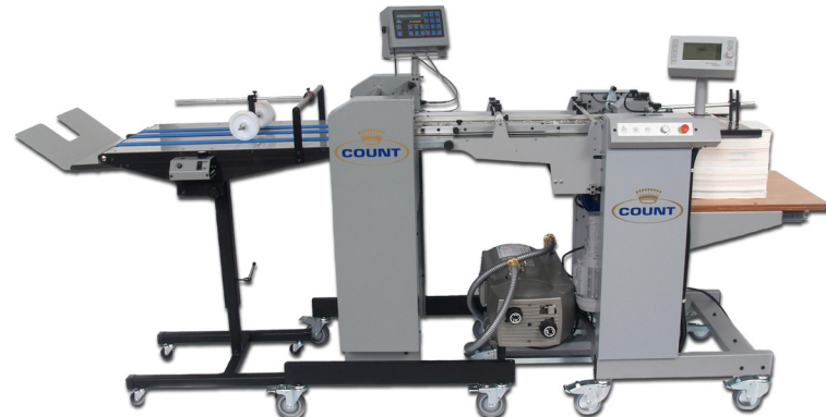
Accucreaser with optional Pile feed and optional motorized delivery