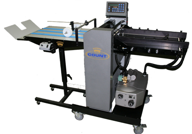
Accucreaser Air Shown with optional motorized delivery