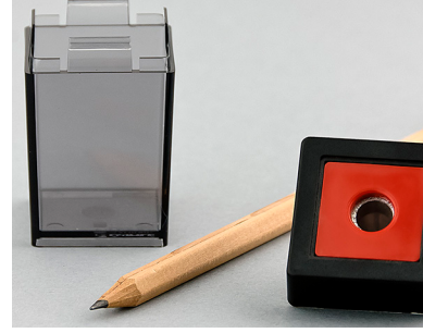
A high impact plastic shell protects if dropped, and keeps pencil shavings from spilling.