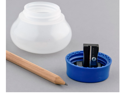
Wedge and canister sharpeners feature screw fastened blades for easy replacement.