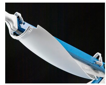
Revolutionary safety guard rotates around the blade throughout the entire cutting process.