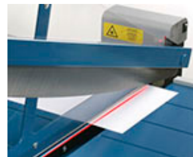
Optional laser ensures accuracy by illuminating the cut line across the entire cutting surface.