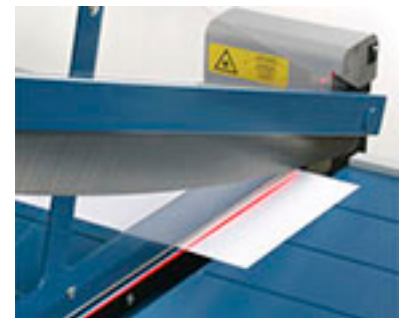
Optional laser ensures accuracy by illuminating the cut line across the entire cutting surface.