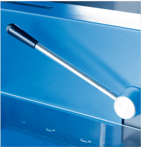
Quick-action clamp compresses evenly and firmly and prevents your work from shifting.