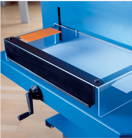
For protection, the blade will not move until the safety cover is in place.

The Dahle 848 Professional Stack Cutter offers strength and precision to cut through up to 700 sheets with minimal effort.