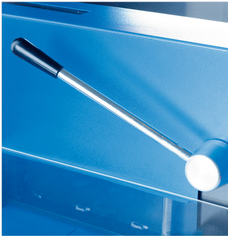
Quick-action clamp compresses evenly and firmly and prevents your work from shifting.