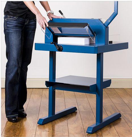
Optional Stack Cutter Stand 718 provides optimal height and additional storage.