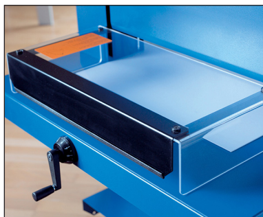
For protection, the blade will not move until this safety cover is placed in the down position.