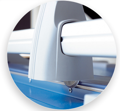
Self-sharpening system maintains a perfectly honed blade.