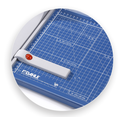
Easily align work with screened inch, metric, and angled guide lines.