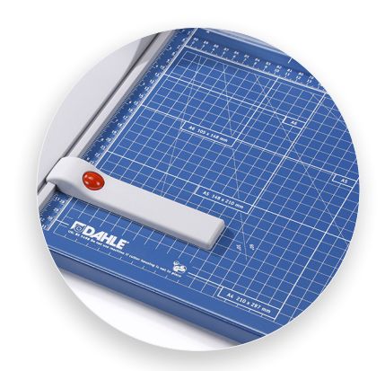
Easily align work with screened inch, metric, and angled guide lines.