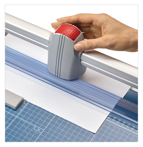
Automatic clamp applies gentle pressure to prevent your work from shifting.