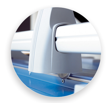
Self-sharpening system maintains a perfectly honed blade.