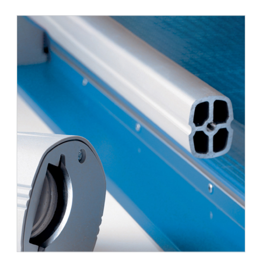
Dual cylinder aluminum guide bar keeps cutting head straight and stable while trimming.