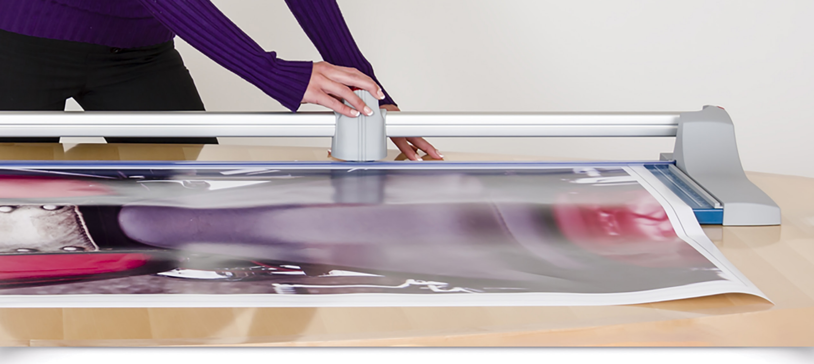
With a self-sharpening blade and a sturdy metal base, this precision cutter is ideal for trimming paper, photos, cardstock, and matboard.