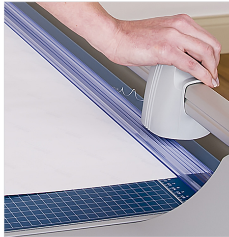
Automatic clamp applies gentle pressure to prevent your work from shifting.