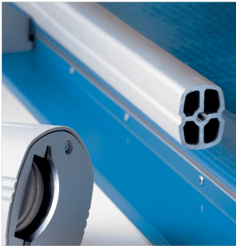
Dual cylinder aluminum guide bar keeps cutting head straight and stable while trimming.

With a self-sharpening blade and a sturdy metal base, this precision cutter is ideal for trimming paper, photos, cardstock, and matboard.