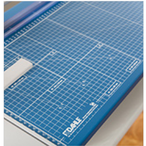
Metal base provides a stable cutting foundation that won't warp or crack.