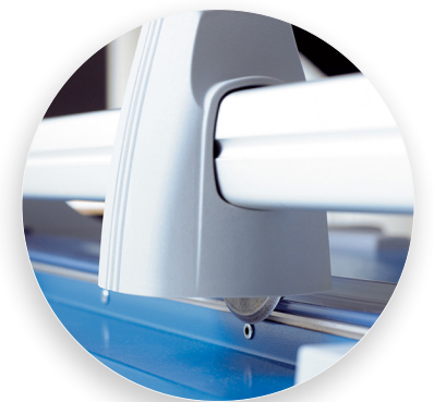
Self-sharpening system maintains a perfectly honed blade.