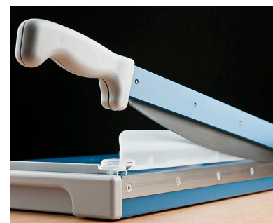
The ground, self-sharpening cutting blade produces a clean, burr free cut.