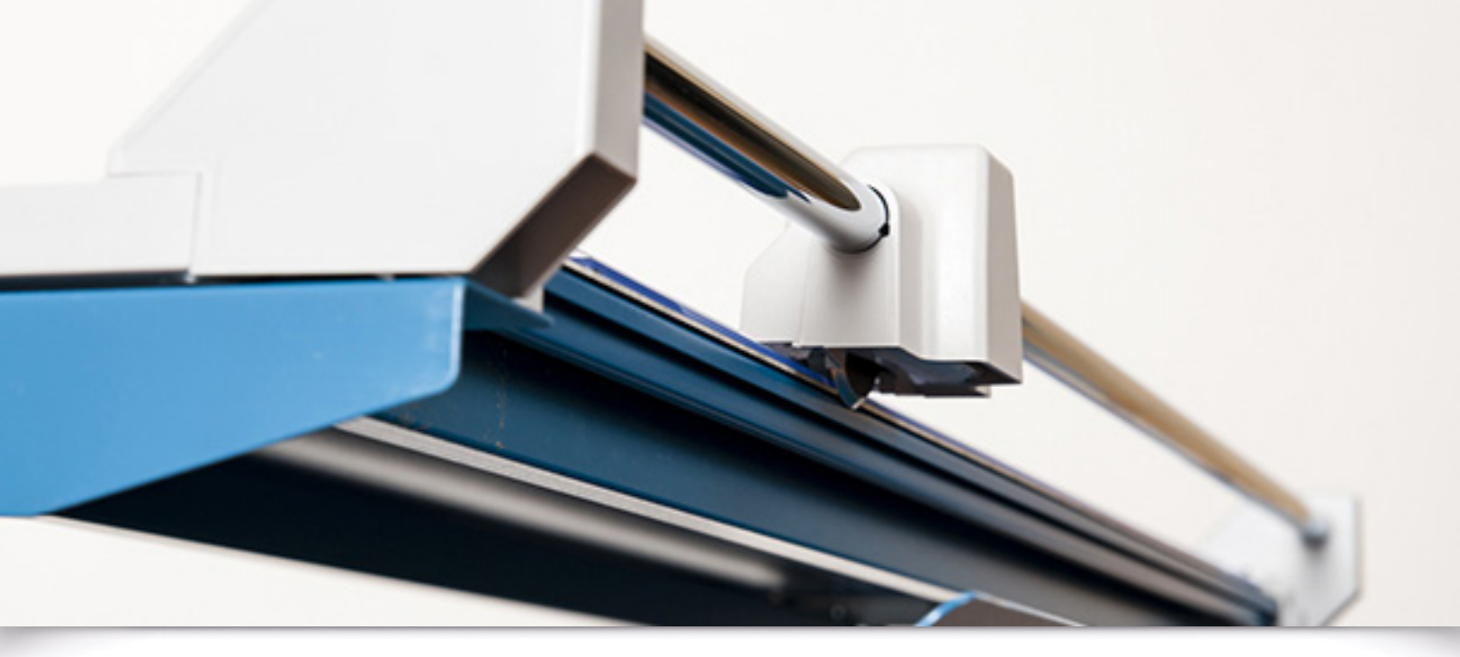
With a self-sharpening blade and a sturdy metal base, this precision cutter is ideal for trimming large format paper, photos and cardstock.