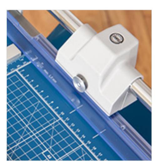
Automatic clamp applies gentle pressure to prevent your work from shifting.