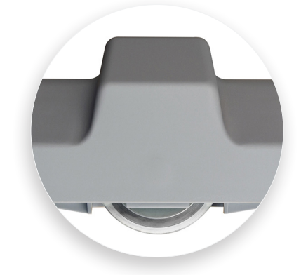
Self-sharpening system maintains a perfectly honed blade.