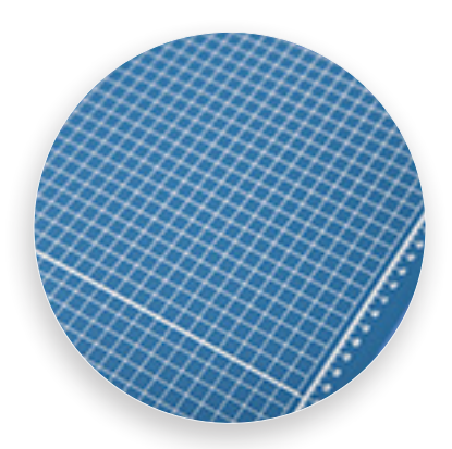
Easily align work with screened inch, metric, and angled guide lines.