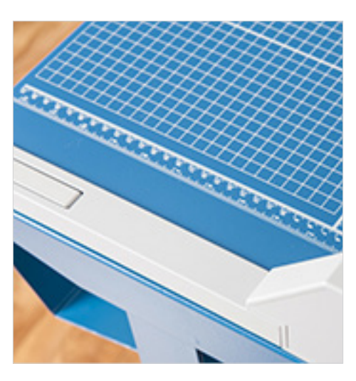
Metal base provides a stable cutting foundation that won't warp or crack.