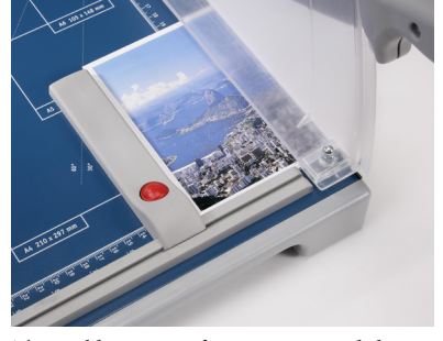
This Dahle trimmer features a manual clamp with built-in finger protection.