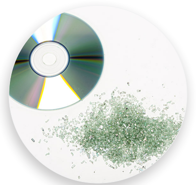
NSA Approved for the destruction of optical media.

The PowerTEC® 717 OS Optical Media Shredder is NSA/CSS 04-02 approved and supports the top-secret shredding needs of military and government agencies. It features a powerful chain driven motor, an automatic EvenFlow Lubricator, and simple push button operation. This optical shredder is NSA rated O-5 for high security destruction and holds up to 20 gallons of waste. It's precision engineered and guaranteed to provide many years of trouble-free operation.