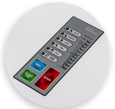
LED keypad with easy-to-use controls for simple operation.