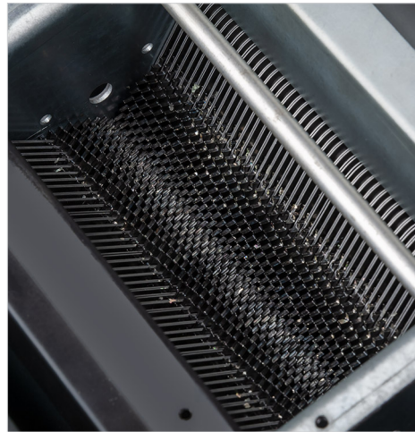
Heavy-duty cutting cylinders are designed for top-secret shredding.