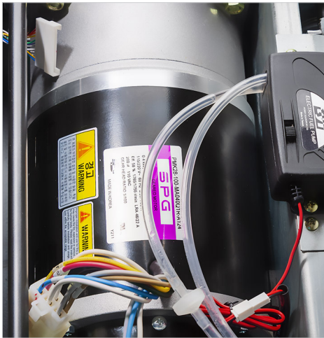
The continuous duty motor won't overheat under frequent use.

The PowerTEC® 717 Optical Media Shredder is precision engineered for high security shredding of top-secret CDs and DVDs.