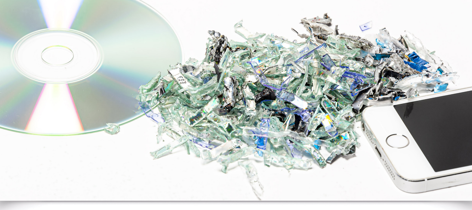
The PowerTEC® 808 Media Shredder shreds SSDs, cell phones, USB drives, mini tablets, and optical media for complete data security.