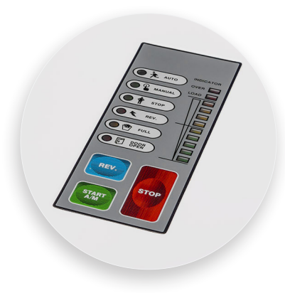
LED keypad with easy-to-use controls for simple operation.

Destroys devices and optical media for complete data security.