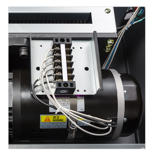
The continuous duty motor won't overheat under frequent use.