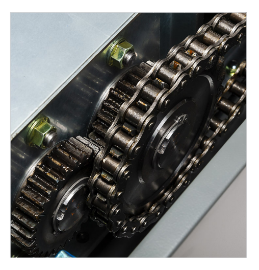
Powerful chain-driven motor provides slipfree performance.