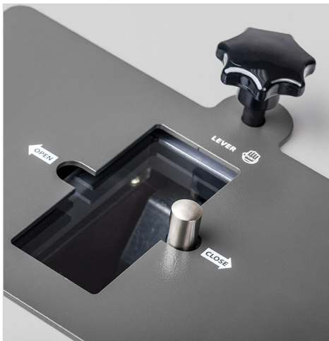
Chute has transparent safety cover that will automatically stop machine if opened.

The PowerTEC® 818 Hard Drive Punch is precision engineered to destroy 3.5" and 2.5" hard drives for complete data destruction.