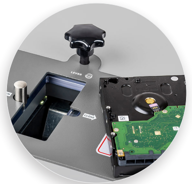
NSA Approved for the destruction of hard drives for complete security.

The PowerTEC® 818 HD Hard Drive Punch is the perfect machine for destroying 2.5" and 3.5" hard drives. It features a powerful chain driven motor, hardened nickel-plated punch bolt, and simple push button operation. This punch is rated for Security Level H-3 and NSA approved for hard drive destruction. It's precision engineered and guaranteed to provide many years of trouble-free operation.