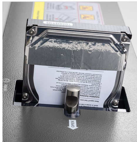
A nickel-plated punch drives a hole through media, rendering them unreadable.