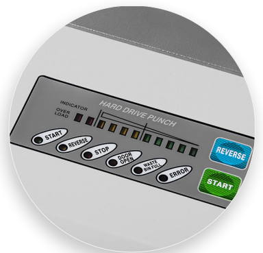
LED keypad with easy-to-use controls for simple operation.