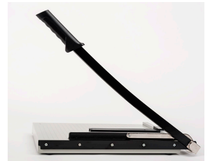
A tension spring returns the blade to the up position after trimming to reduce fatigue.