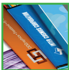
Image Strip Binding – Compatible with Image Strips for the ultimate in presentations with polished corporate identity.

Contemporary Design – Improved ergonomics of strip feed and book cooling rack.