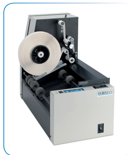
FD 260 Tabber