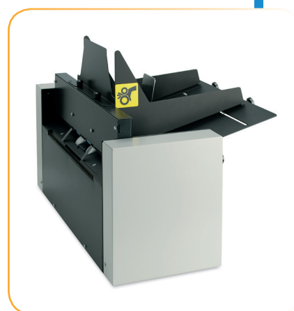
FD 260-10 Feeder