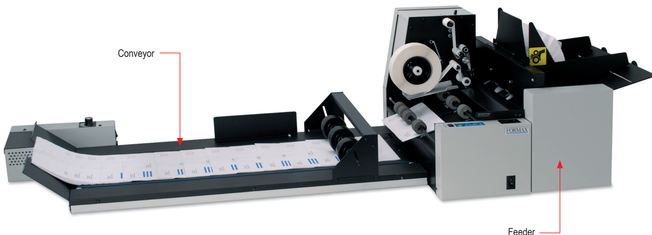
FD 260 Tabber shown with optional FD 260-10 Feeder and optional FD 260-20 Conveyor

The Formax FD 260 Tabbing System makes quick work of applying postal tabs to folded mailpieces. Using “crash tab” technology, the edge of the mailpiece is fed into the FD 260 where it contacts an adhesive tab and travels through a set of rollers where the tab is tightly folded and sealed, creating a mail-ready piece.