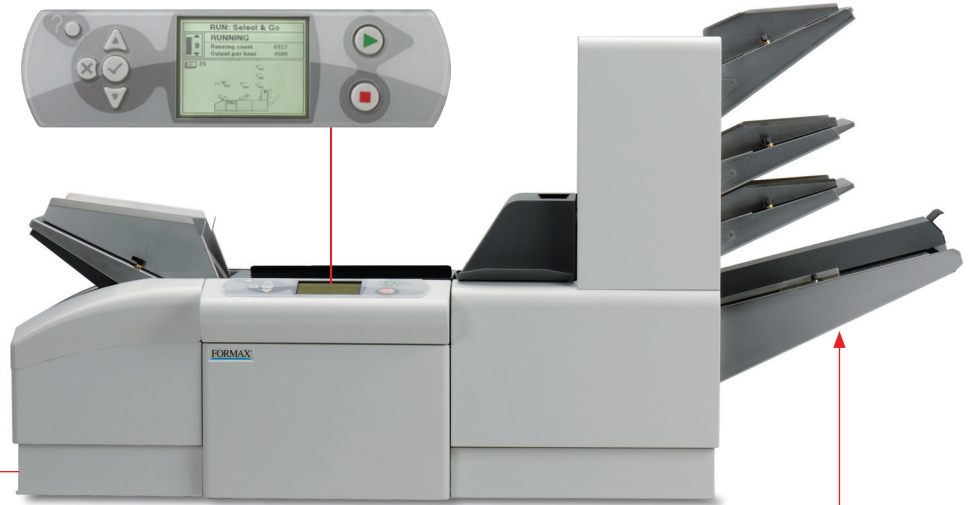
FD 7100-Basic 3 w/ Optional Accumulator