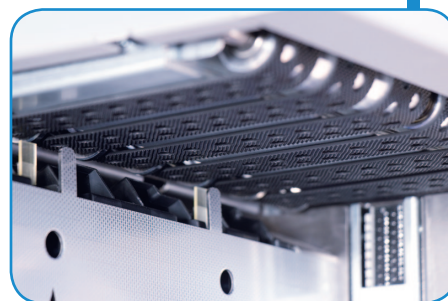
Powerful vacuum top-feed system and optical sensors control sheet separation and make adjustments on-the-fly