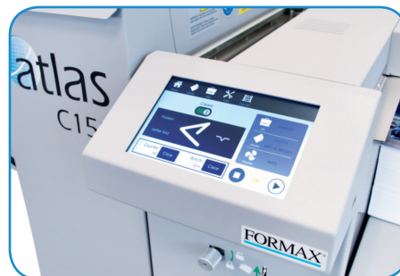
Color touchscreen control panel features bold icons and simple automatic setup

* Speed varies depending on paper weight