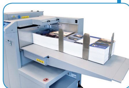
Extra long infeed table extends to hold media up to 51" in length