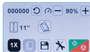
Large color touchscreen control panel

The AutoSeal® FD 2056 is a fully automatic pressure sealer which provides the ultimate high-volume tabletop solution for processing pressure sensitive one-piece mailers. Designed with ease of operation and efficiency in mind, the FD 2056 features a full-color touchscreen control panel, and automatically detects and adjusts for 11", 14" and 17" forms. It offers 5 pre-programmed standard folds for even panel C, V, Z and uneven/eccentric C and Z folds. It also has the ability to store up to 35 custom fold settings with the simple touch of a button.