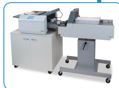
FD 2056 in-line with optional V-Stack36i Vertical Stacker, stand and cabinet