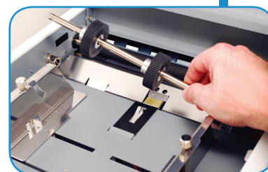
Removable Feed Wheels