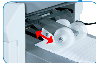
AutoStack™ Stacker Wheels