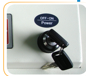
Keyed On/Off switch

The 8804 Series offers unmatched automated features through its LED control panel. The easy-to-read Load Indicator assists operators in determining how close they are to the maximum shred capacity to avoid jams and provide optimal efficiency. Indicators also notify operators when the waste bin is full or the cabinet door is open. Operators can select from two modes of operation: Auto Start/Stop or Manual. Auto Start/Stop mode utilizes optical sensors which detect paper and start/stop operation automatically. Manual mode provides non-stop operation for shredding small sized paper or films.