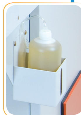
EvenFlow™ Oiling System Reservoir Bottle

Safety is an important component in the 8804 Series design and engineering. A large 18"-wide safety bar is located in front of the conveyor belt system and will shut down the shredder instantly when pressed. A safety key and lock system is also included to ensure the shredder is operated only by authorized staff.