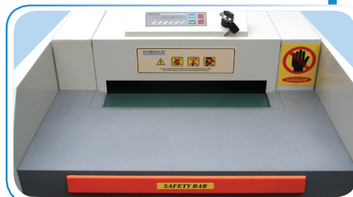
Large infeed deck with conveyor belt feeder and safety bar for immediate shut down

Keeping the 8804 Series in top condition is easy to do. With the Auto Cleaning function, clearing the blades of shredding debris is as simple as pressing Reverse on the control panel. Plus, the EvenFlow™ Automatic Oiling System lubricates the all-steel cutting blades, helping to keep the shredder in peak condition for optimal efficiency.