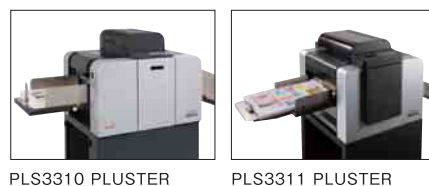
PLS3310 PLUSTER PLS3311 PLUSTER

AL-MEISTER PLUSTER SERIES is a good solution for the single sided lamination of prints on demand, which has been regarded rather problematic because of such difficulties as insufficient bonding strength of the film and higher running costs. Also, operators need to attend the process, which can sometimes be burdensome. It requires space, as most single sided laminators are huge. PLUSTER SERIES will solve all these problems.