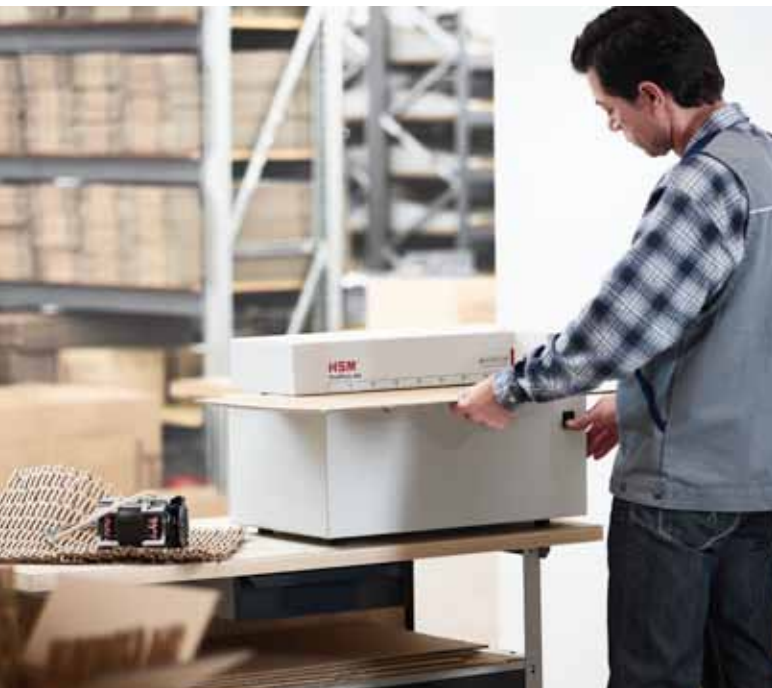
HSM ProfiPack 400