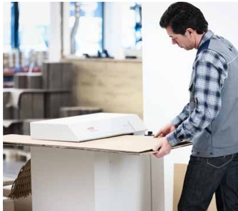
HSM ProfiPack 425