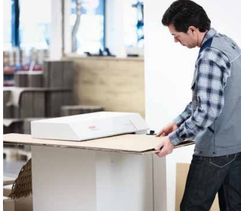
HSM ProfiPack 425