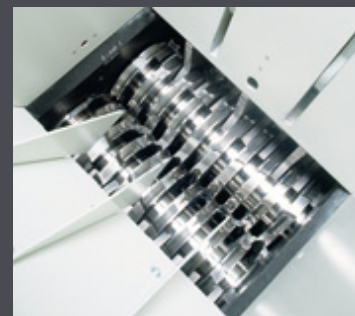
Cutting unit stage 1: Pre-shredder