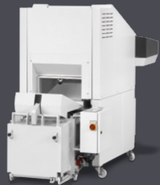
Rear view SP 5080