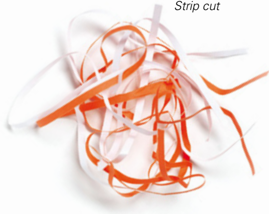
Security level 2 Strip cut