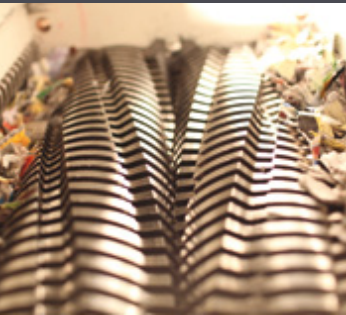
Cutting unit stage 2: downstream shredder

The HSM DuoShredder 5540.2 is a two-stage shredder system for fully automatic document disposal. Depending on the paper quality, loading and downstream systems, it can achieve a throughput of up to 350 kg per hour. In combination with an HSM baling press, you can expand the HSM DuoShredder 5540.2 into a complete disposal system. We recommend the following baling press models: HSM KP 100.1 and HSM KP 88.1.