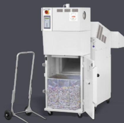
SP 4040: View from the rear with the door open.