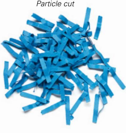
Security level 3 Particle cut