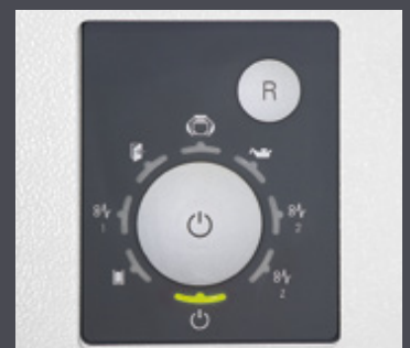
Operating element FA 500.3