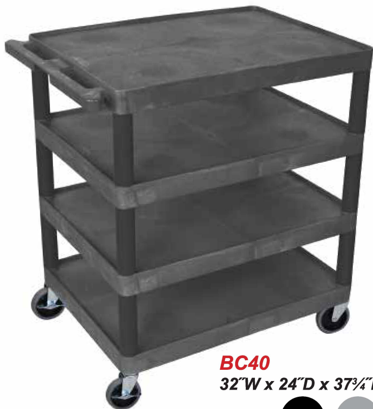
BC40 32"W x 24"D x 37 3 / 4 "H