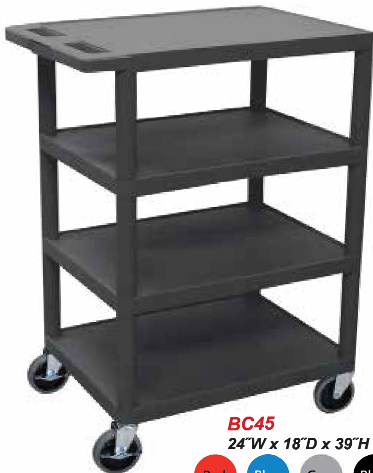
BC45 24"W x 18"D x 39"H