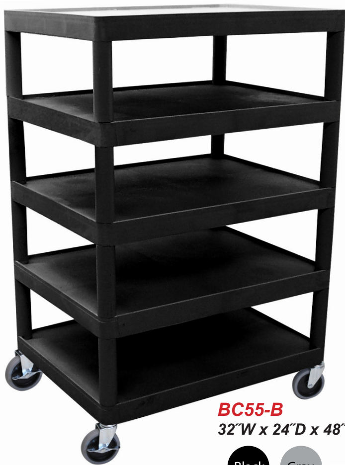
BC55-B 32"W x 24"D x 48"H