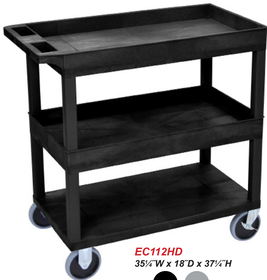
EC112HD 35¼"W x 18"D x 37¼"H