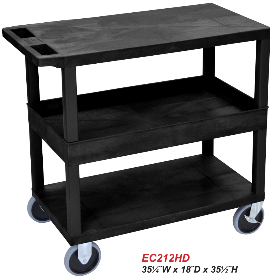
EC212HD 35¼"W x 18"D x 35½"H