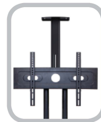
Optional Camera Mount