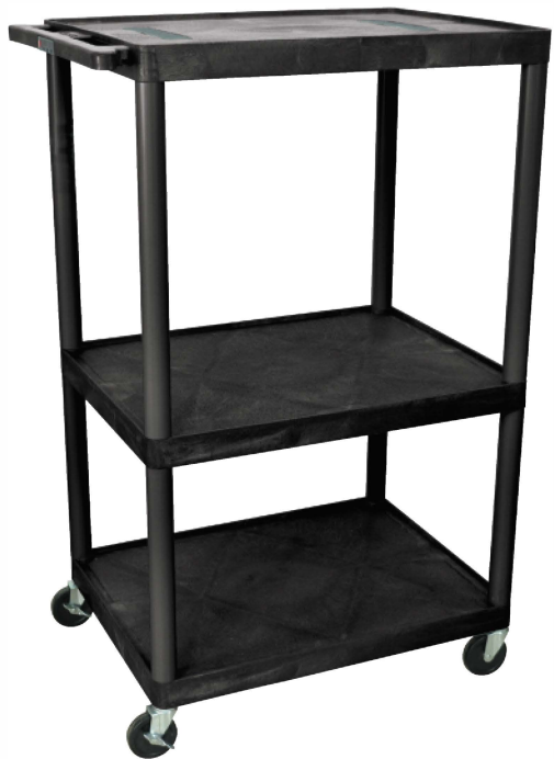
LE54-B 32"W x 24"D x 54 1/4"H