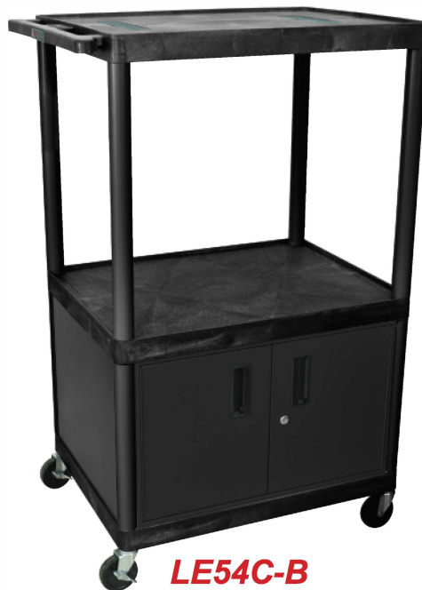
LE54C-B 32"W x 24"D x 54 1/4"H