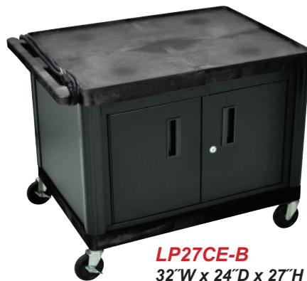
LP27CE-B 32"W x 24"D x 27"H