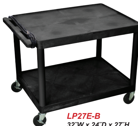
LP27E-B 32"W x 24"D x 27"H