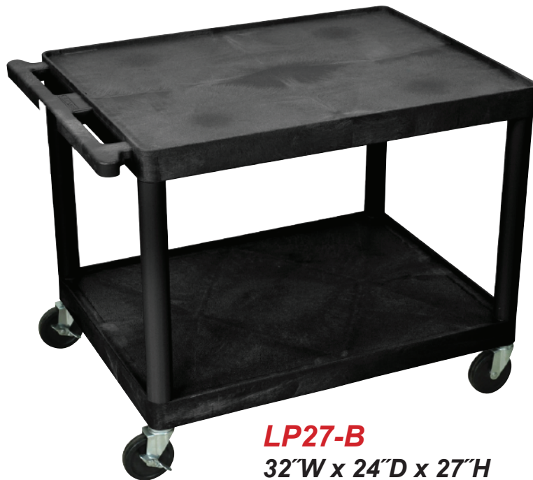
LP27-B 32"W x 24"D x 27"H