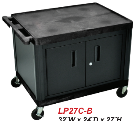
LP27C-B 32"W x 24"D x 27"H